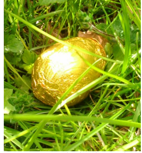
Easter Egg Hunt 2017.

In recent months we've welcomed the Scouts for Mothering Sunday, lots of families for our Easter Egg Hunt and even a real donkey , called Diana, for our Palm Sunday service. We've also had more music. One person emailed after coming on 29th April, 'The concert was fantastic and the performers stupendous.'