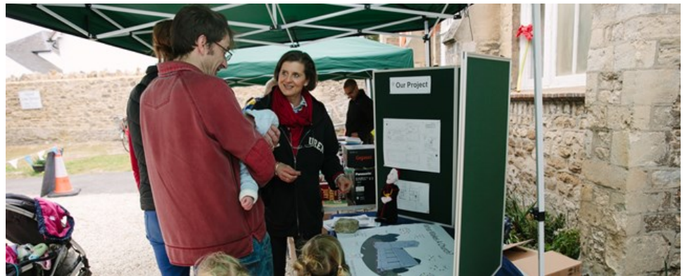
Village Hall Fete on 6 th May 2017.

When we have spoken to you while out and about around the village, you have told us that this is also your dream!