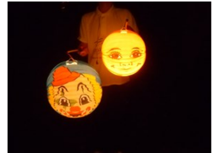
Lantern festival lights

Come and see the design, ask questions and show support!